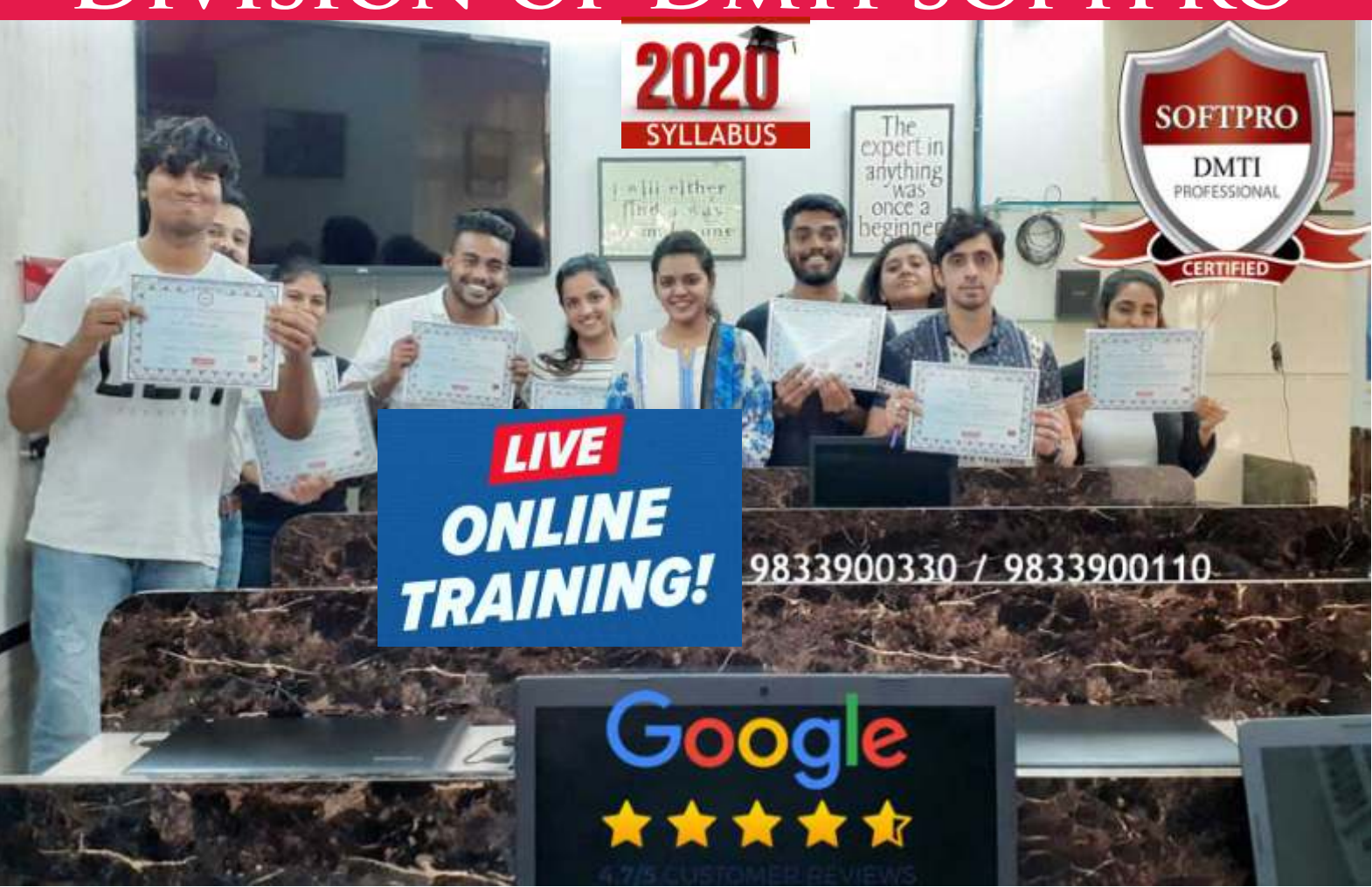
Batch Conducted at Andheri - Thane - Dadar - Matunga Rd West

Dadar: Address: B/2, Vimal Udyog Bhavan, 1st FIr, Nr BPL Mobile, Opp. MOVIE TIME Cinema, Nr Yashwant Natak Mandir, 5 Min from Matunga Rd West Stn, 15 Min from Dadar West, Mumbai- 400016. Andheri Address: PEARL PLAZA, 704, 7th Floor, Just Outside Andheri West Station, Masjid Gali, 1 Min Walk from Andheri West Station. Thane Address: 2 Min Walk from Thane Station. 401, Shreeji Ashish Society, Lohar Ali Rd, near Bhanushali Hospital, Thane West.